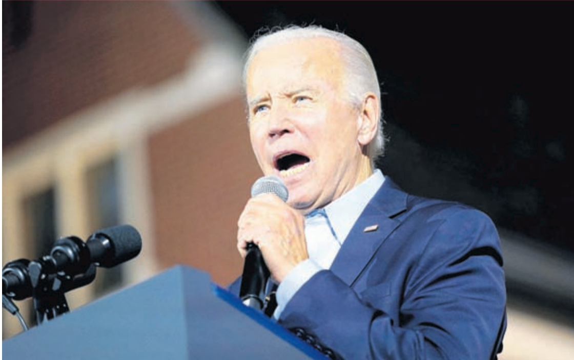
President Joe Biden speaks at a campaign event for New York Gov. Kathy Hochul, Sunday, Nov. 6, 2022, at Sarah Lawrence College in Yonkers, N.Y.